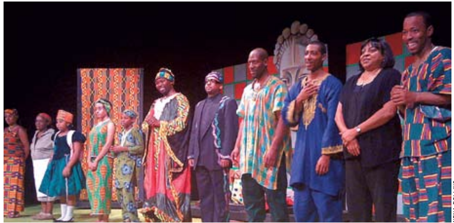
'Twas the Night Before Kwanzaa at Black Spectrum Theatre in St. Albans, Queens.

Jackson Heights is home to large Indian, Pakistani and Colombian communities, as well as smaller Russian, Argentine and Chinese populations, among enclaves of young professionals. For Jackson Repertory Theatre, the rich diversity of the neighborhood provides ample material for works inspired by and about the various cultures in flux, but also creates programming difficulties: Previous shows such as Stepmother in a Sari , about a white woman who goes to India for her stepdaughter’s wedding, and No Solo Mio , an audience-participation solo show about,